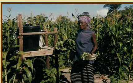
ASAP has 50 Drip irrigation kits funded to date.

The new $25,000 grant to fund ASAP's HANDEI project will allow over 6,000 families to improve the lives of their families with relevant skills. One woman from each of 55 villages, a Cluster Facilitator (CF) selected by her peers, will attend training in HIV/AIDS awareness, growing medicinal herbs, nutritional gardening, perma-culture techniques, and psycho-social support. These skills and training will be carried back to the villages to benefit the entire community.