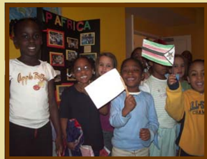
The Study Hall's International Festival

Remember, ASAP is seeking in-kind contributions of school supplies to further assist the 110 schools actively involved in ASAP's Bridge the Gap project. Imagine, many children do not even have a pen or pencil! ASAP believes that education is the foundation to eliminating poverty and we need your help in providing the much needed resources. If you or anyone you know would like to help please e-mail shannondunn@asapafrika.org or call 770-632-7451. Everyone can make a difference...it takes one step at a time!