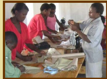
Adolescents require basic skills to earn a living.